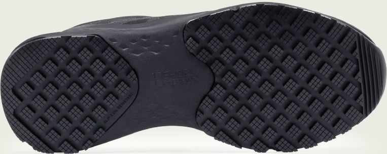
Midsole Material - EVA